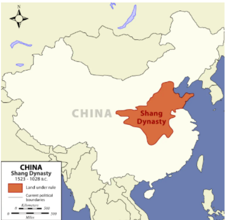
A map of the Shang Dynasty