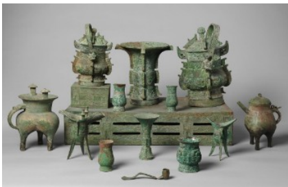
Bronze artefacts from the Shang Dynasty